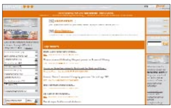
Think of a category and moreover.com will have it

News Harvester (http://webreference.com/headlines/nh) is another such service operated by Internet.com, and covers 20 news categories such as e-commerce, Internet, finance, Web development, etc. You can