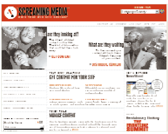
Get streaming media with www.screamingmedia.com

consists of over 2,800 publications, supplying content to more than 1,100 subscribers such as MSN. Among its prominent providers are Associated Press, New