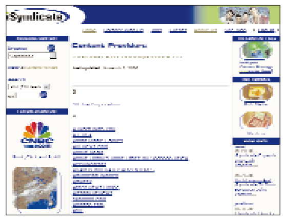
iSyndicate, the most preferred destination for free content

display. The site provides for a lot of customisability. The ticker is in the form of a Java applet, so all you need to do is paste the code generated by the Web site on to your page and you are up and running.