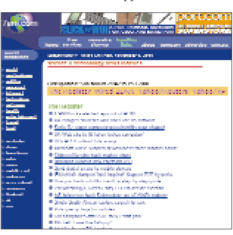
7 \mathrm{am}\ \mathrm{gives}\ \mathrm{you}\ \mathrm{breaking}\ \mathrm{news}\ \mathrm{before}\ \mathrm{anybody}\ \mathrm{else}

Since content providers provide content through proprietary solutions, these are fraught with technical problems. To tackle these issues, a consortium of application server and content companies,