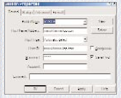
Fill in the Host Name, User ID and password of your Web hosting service

Step 1: Start WS_FTP LE. You will now get the Session Properties window. Enter Host Name, User ID and Password and click the OK button.