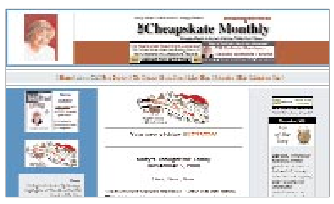
Struggling to earn your daily bread? Take a few tips from www.cheapskate.com