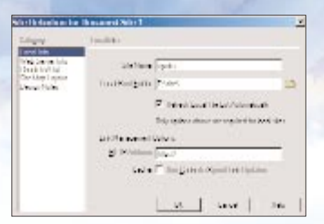
Choose a name and local storage folder for your site

Step 2: In the same window, from the Category tab click on Web server info and fill up the necessary information such as