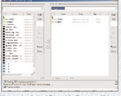
You can view the local files and the files at your Web site in the same browser window

Step 2: Now WS_FTP will connect you to the site where you are going to publish your pages. Once connected, you get a window similar to that of Windows Explorer. In the left pane of the